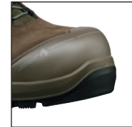
HAIX® Nano-Carbon Toe Cap