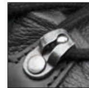
Smooth running lacing elements